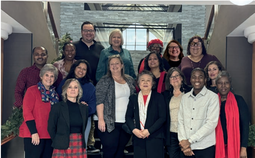
Ministry Centre staff at the staff retreat