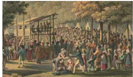
A Methodist open-air meeting