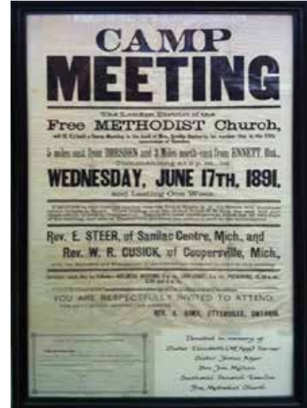
Advertisement for an 1891 Camp Meeting in Ontario