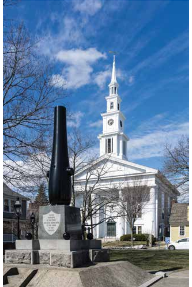
Warren United Methodist Church (built in 1844) and Civil War Memorial, Rhode Island