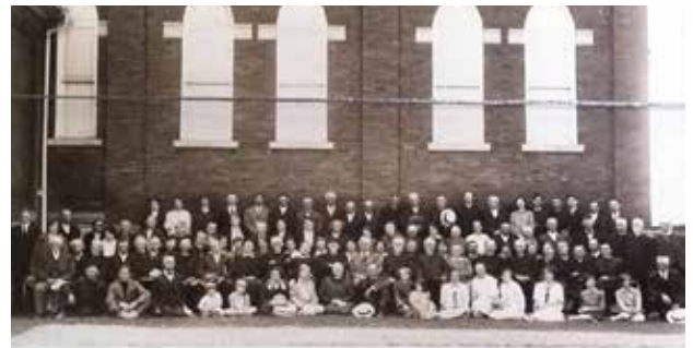
West Ontario Conference, Sarnia 1927