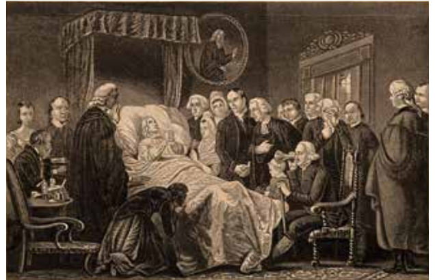
"Death Of the Rev. John Wesley"