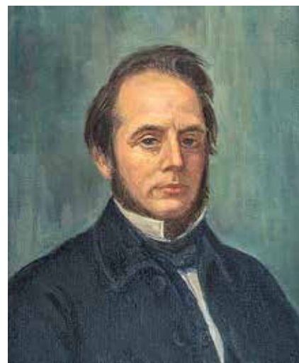
Benjamin Titus Roberts