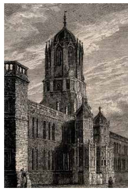
Christ Church, Oxford