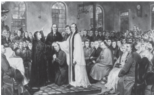
The Ordination of Bishop Asbury, 1784

Francis Asbury is sent by Wesley as itinerant missionary to America. Asbury would become the beloved circuit-riding leader and catalyst for growth of the Methodist movement in America until his death in 1816.