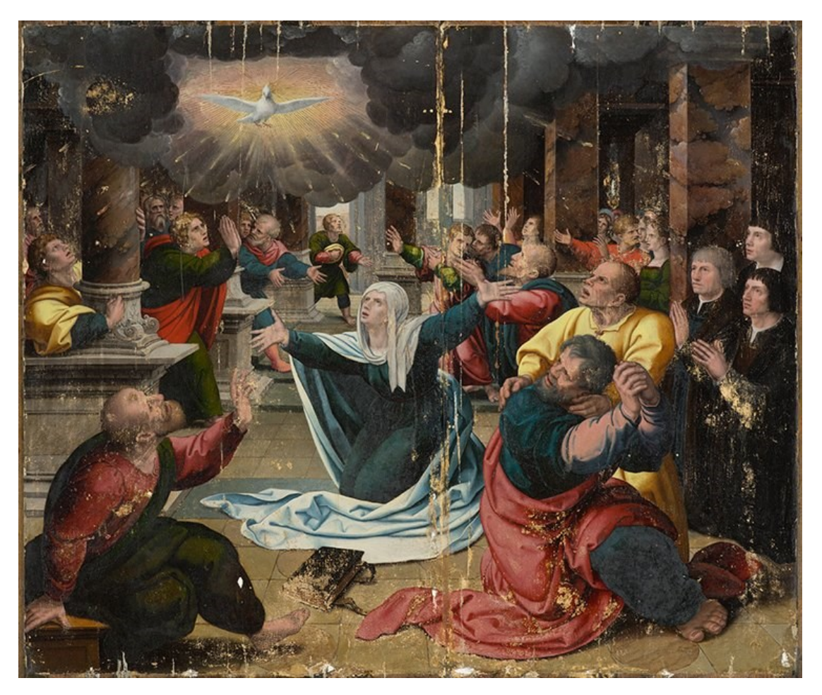
The Pentecost by follower of Bernard van Orley (1530)

Today, we pray for healthy churches in the Free Methodist Church in Canada, committed to growing in holiness.