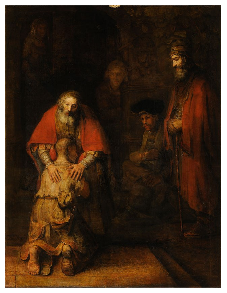
Return of the Prodigal Son, by Rembrandt (1668)

Today, we pray for a continued and renewed commitment to live out the biblical vision for human relationships in the Free Methodist Church in Canada.